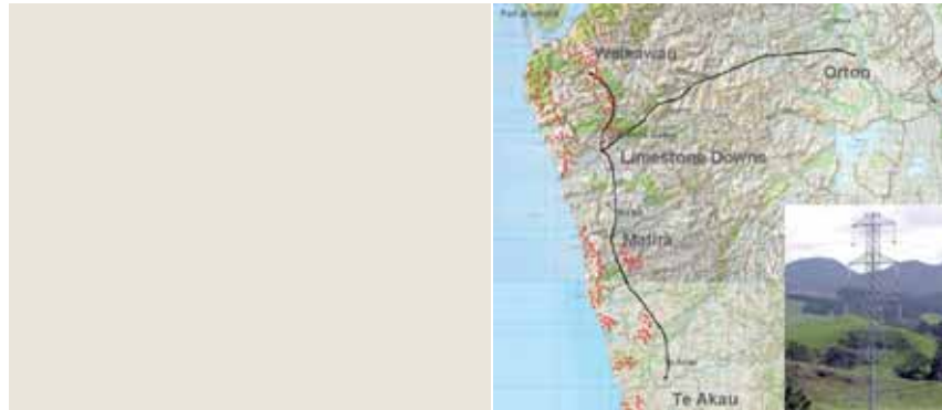
FIGURE 3: Proposed electricity transmission route

The line connecting the wind farm to the national grid will comprise double circuit towers carrying two 220kV lines that will look like the picture you see below. These towers will be spaced at approximately 450 metre intervals and will have a height of around 40 metres – very much the same height as existing transmission towers in the area. Lines connecting the Waikawau substation to other substations within the wind farm will be 220kV circuits carried on poles (see Figure 4).