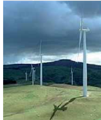
Wind turbine on ridgeline